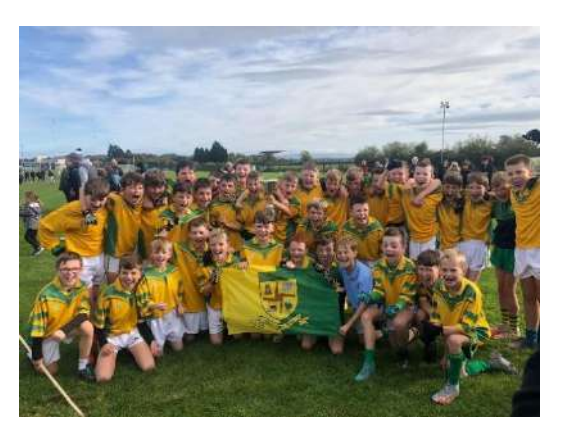
U-11 Boys County Champions