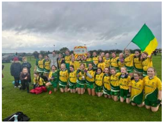
U-11 Girls County Champions