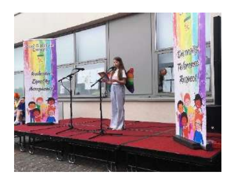
5<sup>th</sup> Class News

5th class students have had a wonderful summer term in Scoil Bhríde. There have been many fun activities happening in the school, and we have also been very busy finishing up each of our curricular subjects for 5th class, doing assessments and lots of revision so that we are ready for our 6th class teachers in September!!