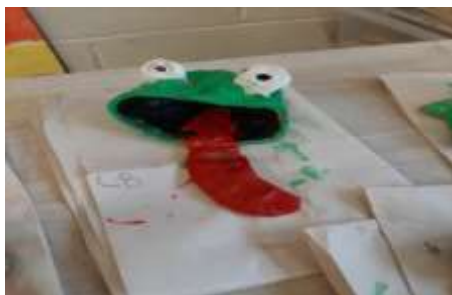
Clay Art by Caoimhe Braiden