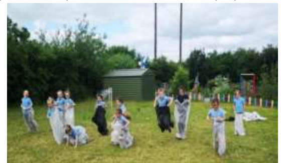
Sports Sack Race!

about our school tour to Pine Forest. We can't wait for an action packed day, filled with fun, adventure and crafts. We have to get up really early to get the bus! Our teachers think we are fantastic!